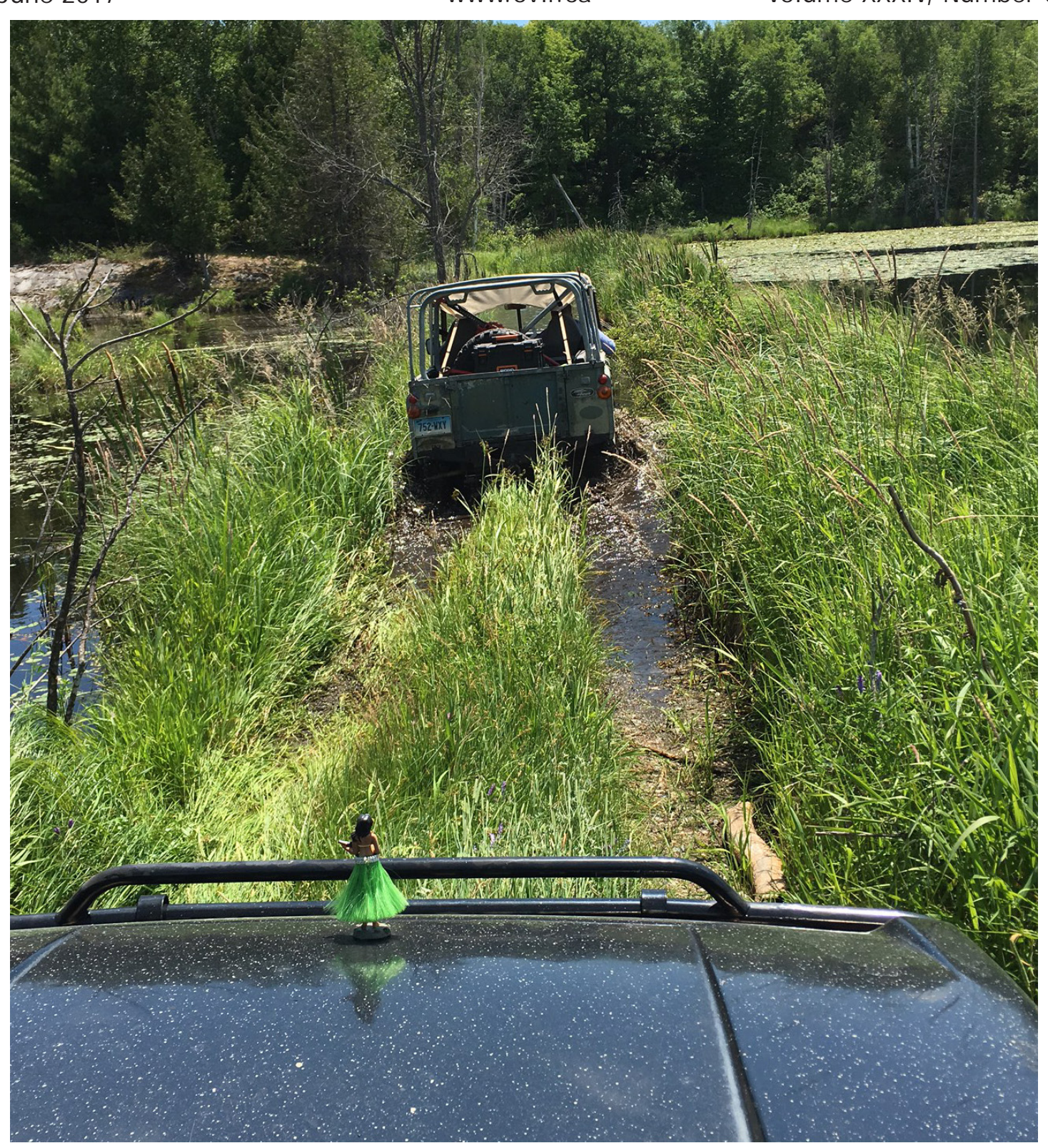
You never know where the hulu dancer may be....