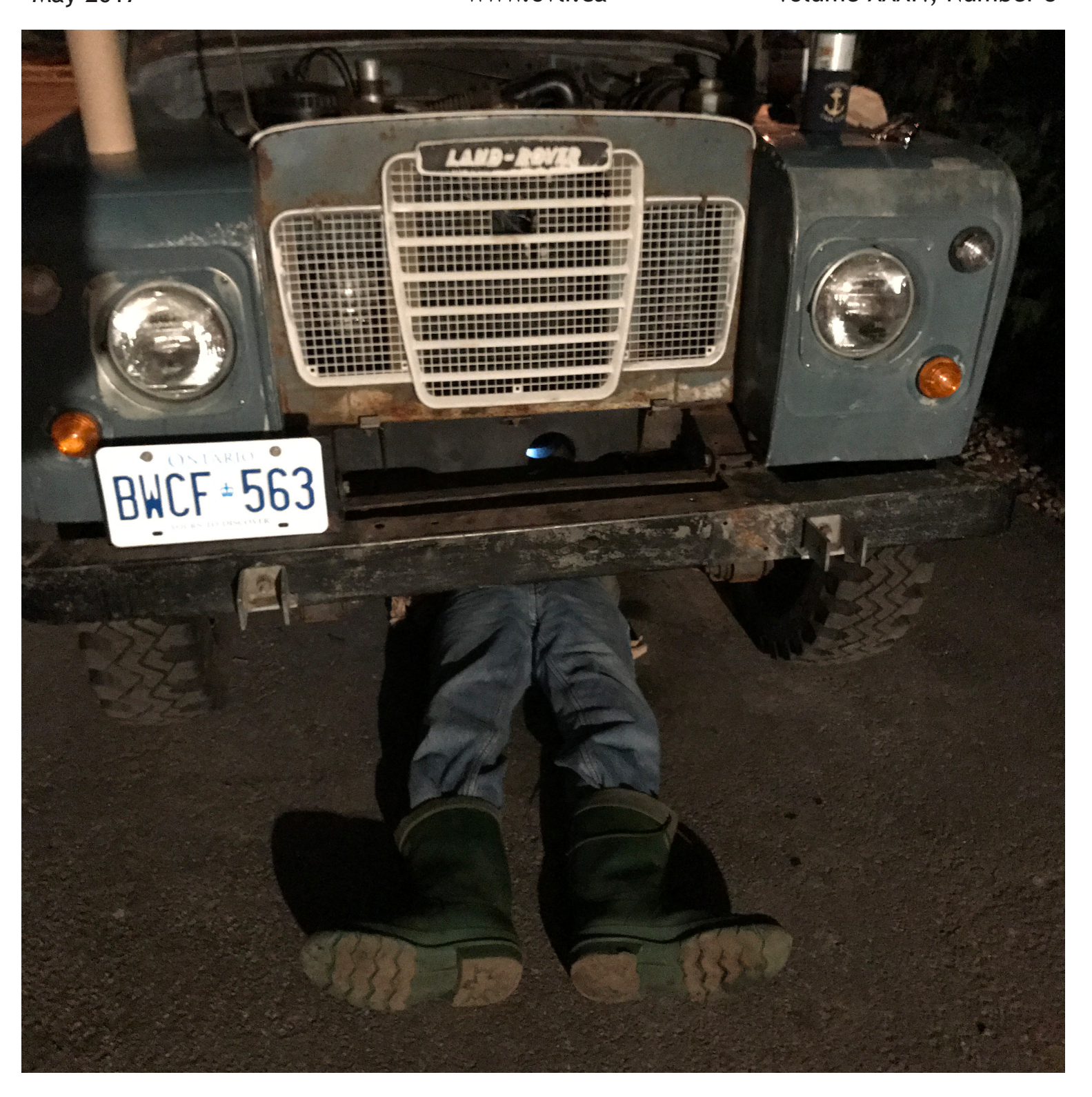
Getting ready for the 2017 OVLR Birthday Party