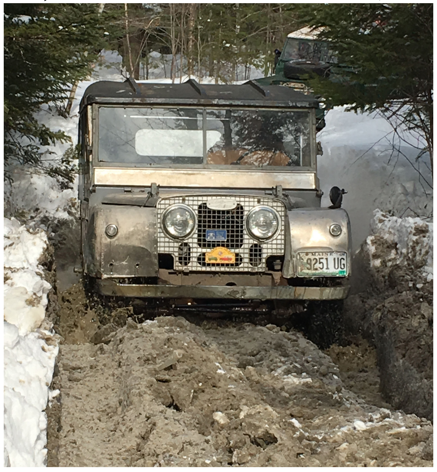
Winter Romp 2017 - and a good time was had by all! (Photo of Ben Smith)