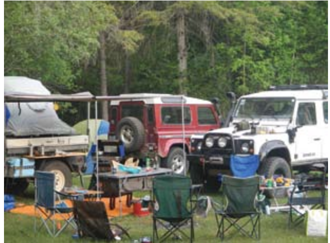
Campsite at Rideau.

saying “Go Right”, but they meant “Really Right”. We all got through in any case. Frankly, I don’t know how the bikes do it, they are much lower than us and don’t have snorkels, so I guess they walk, go around, or in some cases fall in, as one rider told us later.