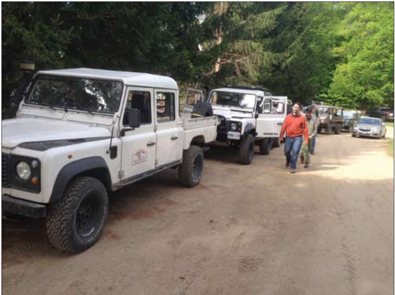
Report on Roaming Rally 2016 –The start of Day 2. (article and more photos on pages 6-8)