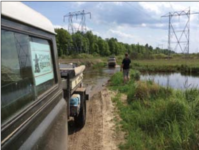
On a hydro line near Calabogie.