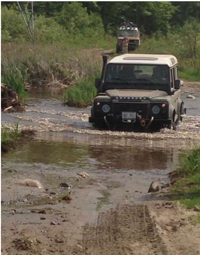
Kevin and CTX in the water.

We struggled to get the 7 vehicles all ready at once and left a little later than planned, but we got away in any case. The day started on pavement, changed to gravel then back to pavement for the first half hour then headed off to a nice hilly wooded trail with some water and some rocks, Not difficult but you needed to stay alert. We were also getting passed by bikes on occasion, so keeping eyes and ears open was necessary. As the day wore on the heat rose and we were also winding in and out of hydro lines and forests. The dust was very heavy at times, with maybe 100 feet of visibility in either direction. This slowed us down to a crawl at times, but we carried on. The hydro lines were necessary because they also provided the deepest water crossings of the weekend, usually in spots far from the woods. There are one or two photos that show the crossings. Kurt actually put his Defender vents under the water at one point because he was first and we had no point of reference on the depth. There was a group of bikers