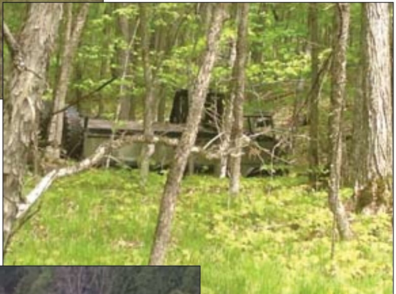
Francois and Moggy in stealth mode.