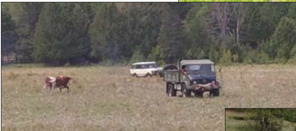
Francois pulls Ian from a cow pasture.