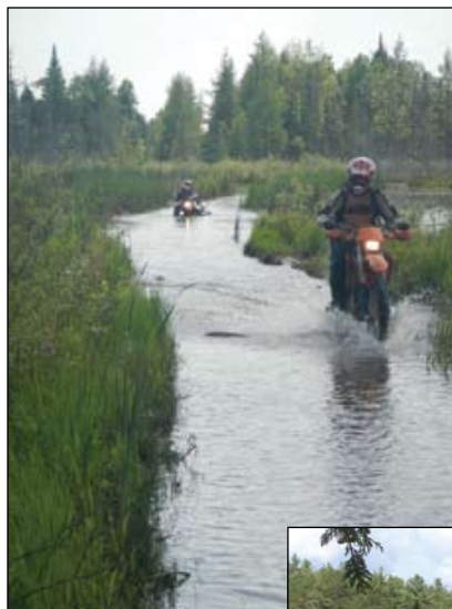
Our traveling companions.

We had decided as a group to leave about 9 in order to cover the roughly 200km laid out for day 1, and we did so within a few minutes. The first short leg was on gravel, then we did about 30 minutes on pavement, with a few false starts while we synchronized our 5 gps systems. The only maps given out were electronic, and while I had paper back up of the area, there were not many waypoints documented. What this meant was maybe a half dozen turn arounds once the gps