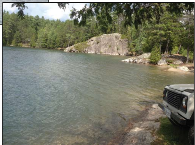
Kurt at the lake for lunch.

We finished the loop and returned to camp at 4:00pm just about when we wanted. There had been no casualties, no breakage and no towing required. So we settled in for dinner and had great evening just hanging around the fire and swapping stories. Toze from