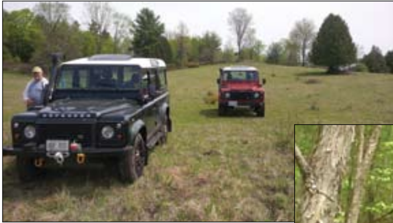
Defenders find the path.