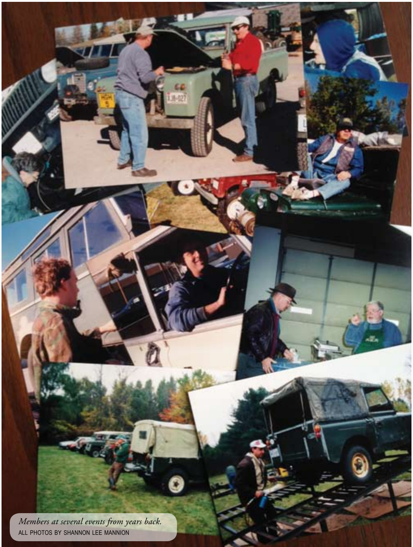
Members at several events from years back.