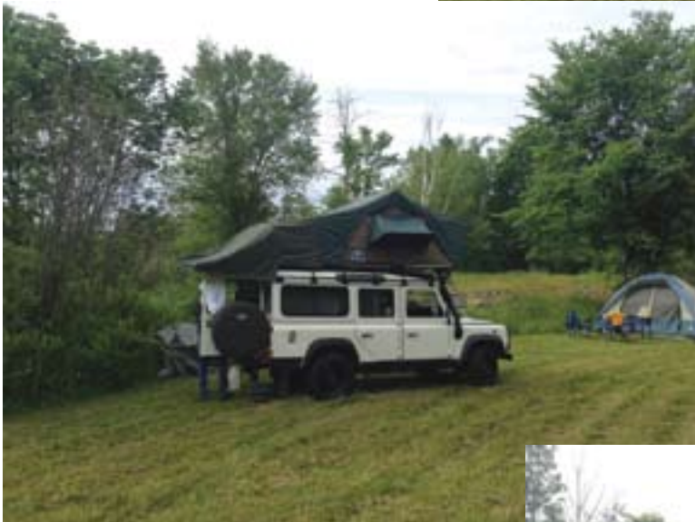
Steve's 110 with onboard tent.