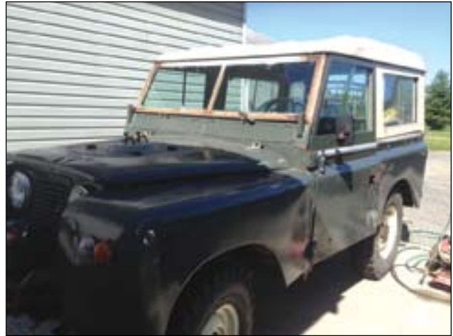
Alastair's Series rests in the shade at AF's, out of the reach of pesky elms and oaks

Bruce then tackled the backup lights on Clifford because they showed a constant state of reversal... however, despite some great efforts, they remained stubborn until the offending switch was given a respite... switch is now on order no doubt.