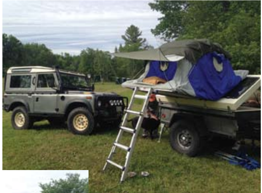
Kevin N's camping setup