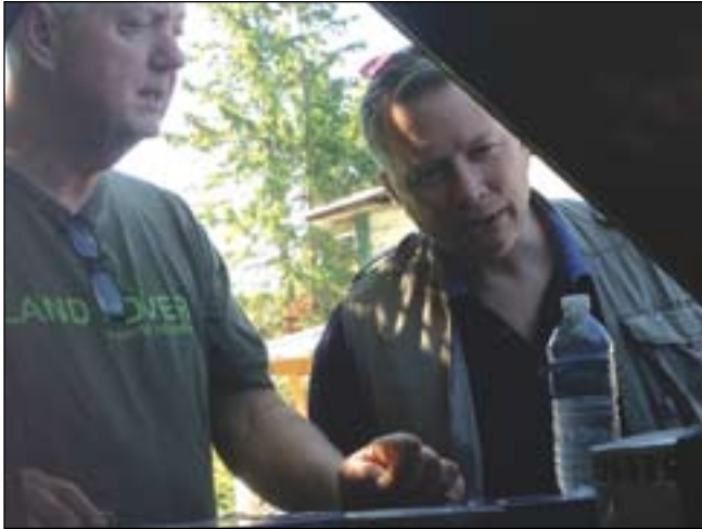
Host AF and Kevin discuss the fact that Stan's original 2.25 petrol engine is now installed in Dustin's 109 (will be seen near Cheshire Cat Pub)