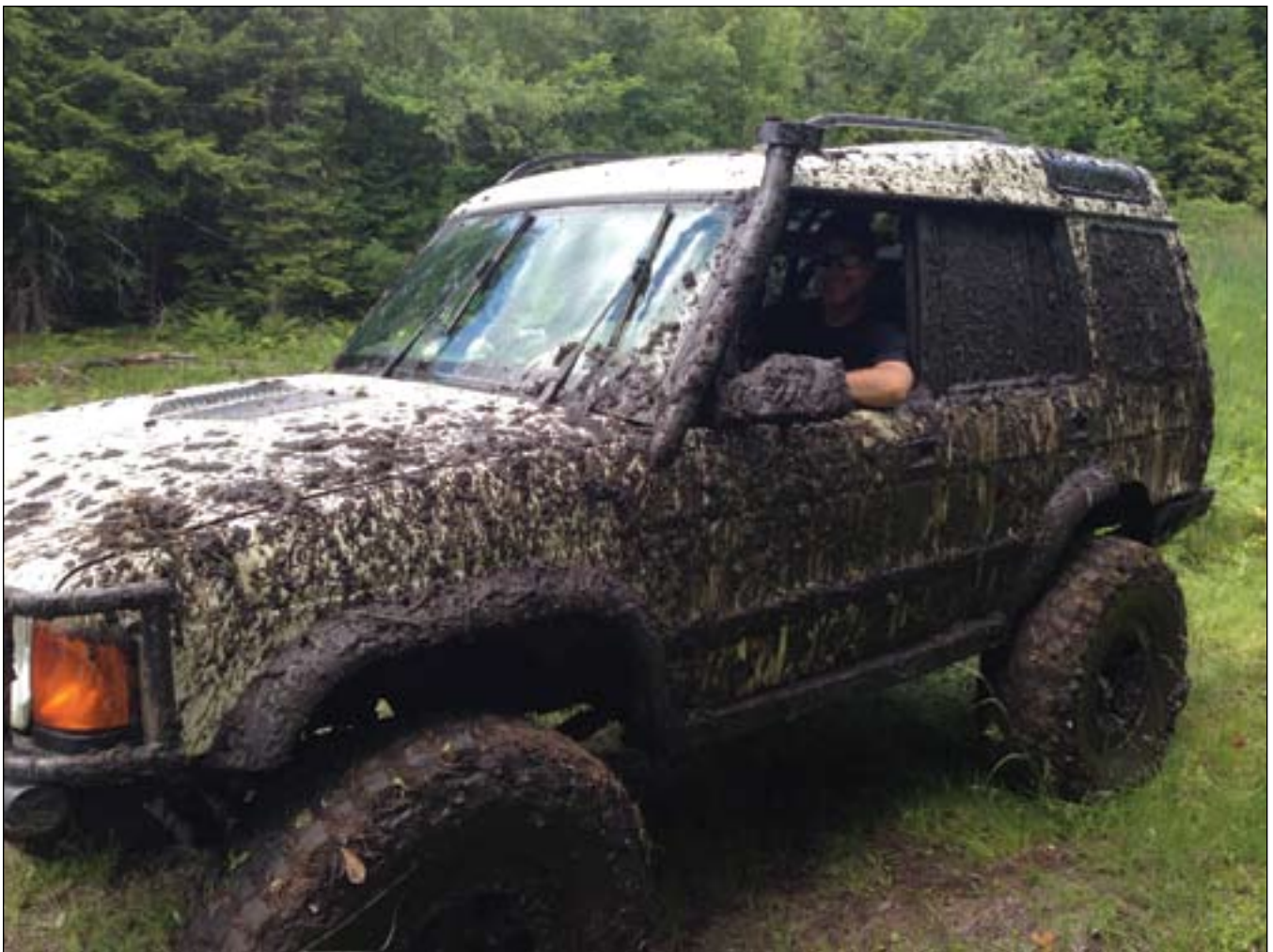
Patrick F's Disco after a successful run on the heavy offroad. (more photos on pages 5 and 12)