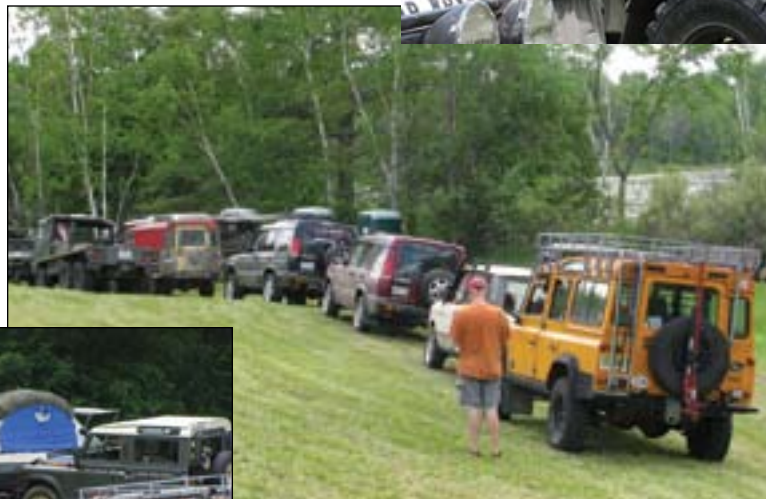
Lining up for an offroad