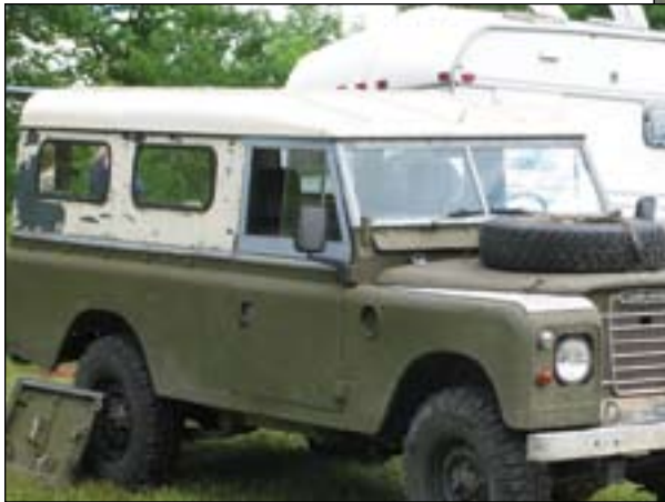
109 at rest.