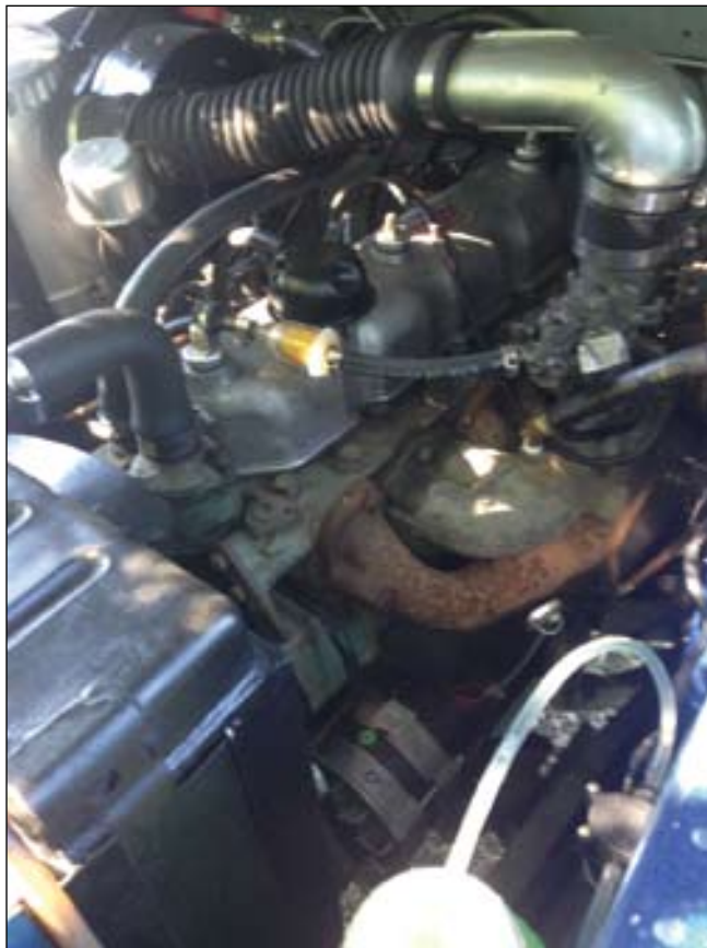
View of Stan's transplanted petrol engine as noted in previous photo.

While several of us TRSS (Ted Rose Sighting Society) types hoped with great anticipation that the legend would arrive, it became clear that with his imminent move would keep him busy loading the string of 18 wheelers with spare parts, etc that were being shunted to their new home. I suspect it is not a 1 room apartment.