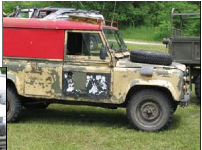
Eric's 109 while still clean.