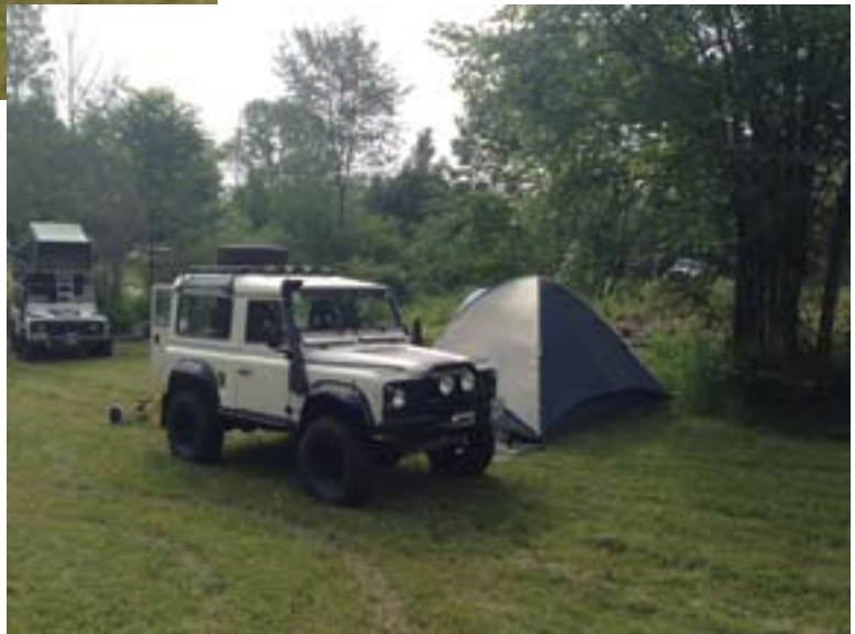
Yves Fortin's D90