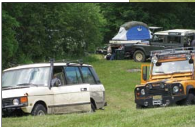
Waiting for Godot.