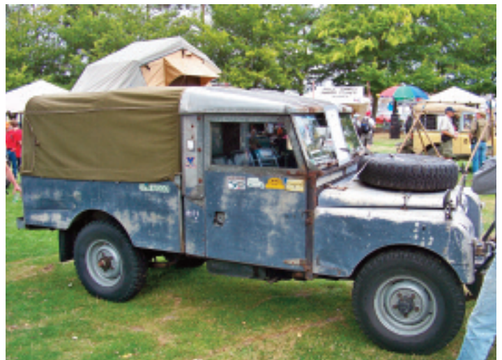
A Canadian Forest Service 109" with 1 piece doors spotted in OR

Pictures to follow, but it is HOT. Nicole said she liked it more than the stock bumper. It apparently offsets the roof rack and rear bumper better now. Excellent.