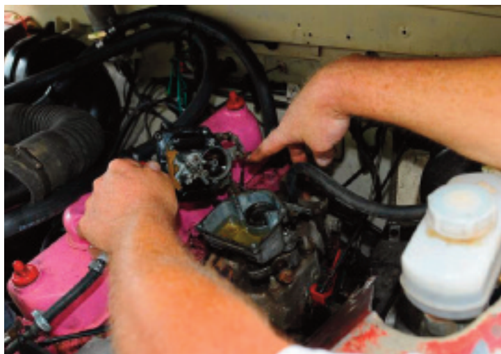
WASHME's pink engine

Finding an underlying cause: What I did eventually notice and I think that this may be the problem. When I rev the carb at the carburetor it really sounds perfect, but when I press the accelerator pedal, then I do not get the same results. I disconnected the linkage and found about 12mm difference which I have rectified.