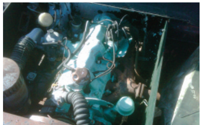
Armored engine bay of the Shoreland