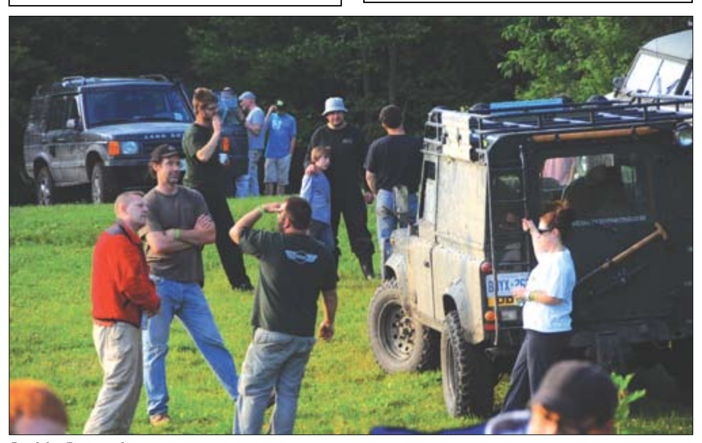
Birthday Party gathering

100% Canadian owned & operated business c/w British Mechanic (We own our own premises, so are here for the long term!) We are also OVLR Club Members = Enthusiasts serving Enthusiasts!