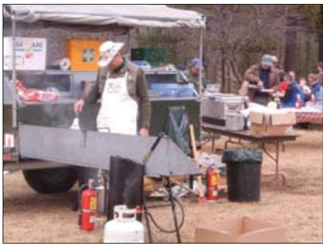
Another great meal at the Maple Syrup Rally