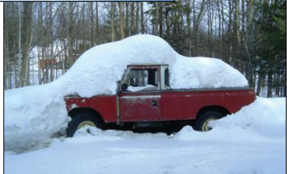
Mud...a fair weather sport !!!