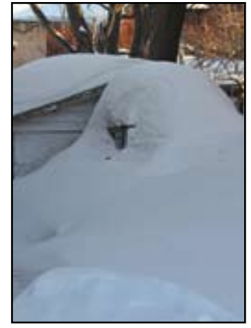
Hmmm...maybe I should have used the garage last night...