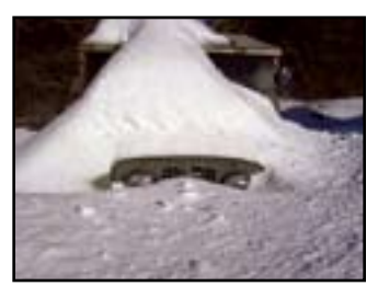
I'll be 57 next month.... Don't I deserve a better place to sleep?