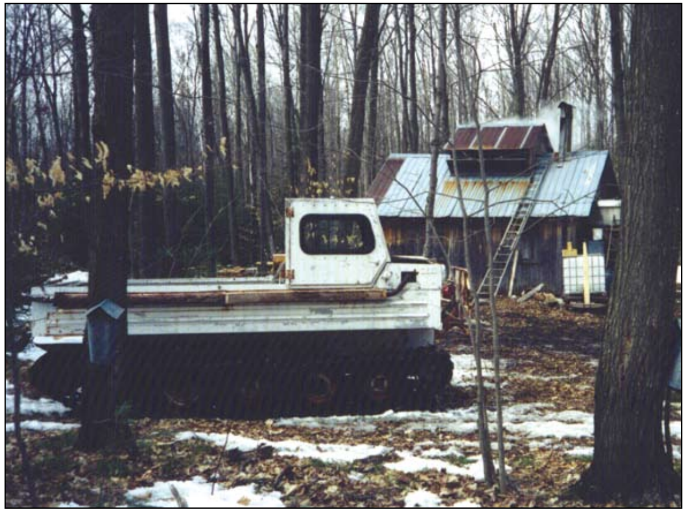
The Sugar Shack Beckons (see page 11 for article and more photos)