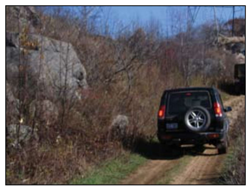
Hydro line near Lingham Lake, Guy Fawkes offroad

their trucks and loading the atv's to go into their huntcamps (note to self, we do not want to be in the bush on Monday morning... opening day of deer season) I opted to go on the medium trail, which was under the powerlines and ran parallel to highway 7 off Highway 62 coming out on Highway 41 near Kaladar. Most of the trail was easy greenlaning with lots of rocks. I took the tail end position and followed Jean-Francois in his Disco. It's nice watching a technical driver, Jean-Francois carefully places the wheels of the Disco on the major rocks and let the truck slowly crawl up and over them ensuring he doesn't damage his truck. (He later confided in me that he has to