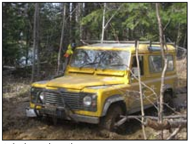
Defender on the trail.