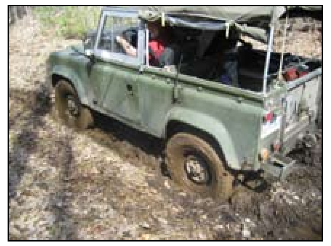
Climbing Back Up

bought their syrup, and looked at the trucks. Vern went the extra distance this year and found a supplier for great looking clay jugs with an OVLR label for the syrup. Thanks Vern!