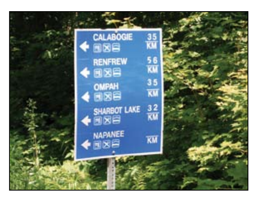
... continued on page 5

enough and clear enough for a full sized vehicle.