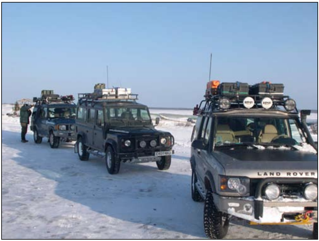
Part 1 of the trip and more photos on pages 6-8