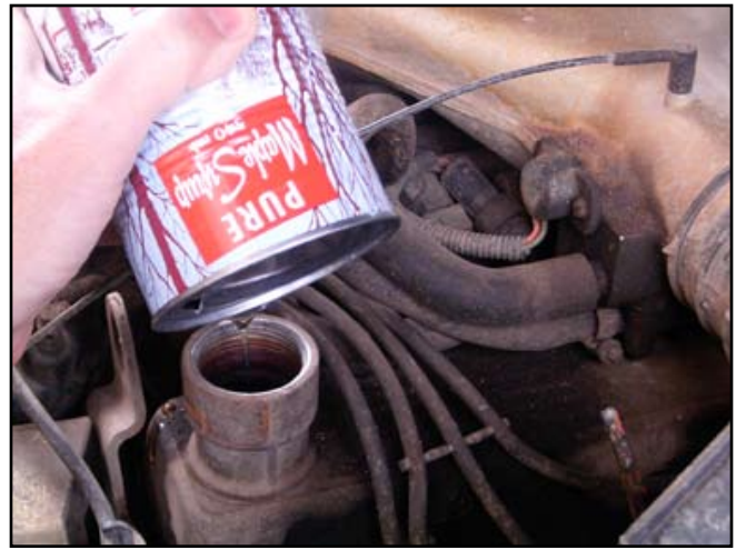
Be sure to top up your fluids for the run ... And be careful which can you grab ! < G >

Vern has also encouraged brave souls to come up on the Saturday for an overnight camping. He's volunteered some firewood for a campfire and a few choice spots to set up camp. Interested parties should RSVP indicating their preference. It has been heard that in order to avoid yet another