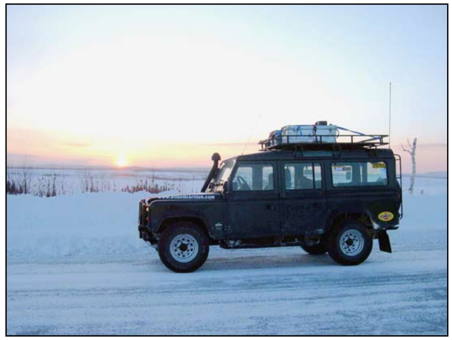
Sunset in the north.

instant starts in the coldest conditions – thanks, Kevin! All the Discos carried at least three extra jerry cans each for their thirsty V8s. The two 300Tdi Defenders, though, could easily go over 600 km on one tank, and so carried just one extra jerry can each. Jim's 110 in fact was also fitted with an extra long-range tank. And, it should be mentioned, we had all packed Arctic-spec parkas and outerwear, as well as other cold-weather survival kit. We would need those parkas, as it turned out.