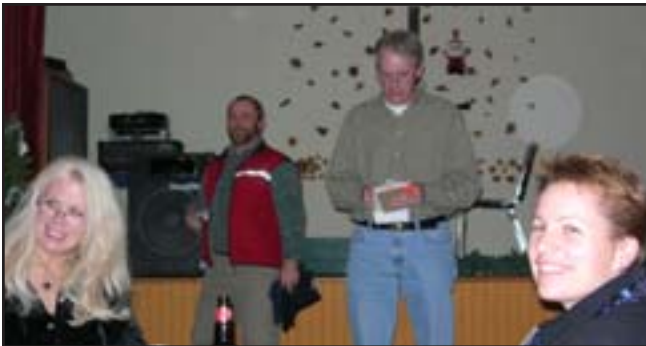
The fans smiling