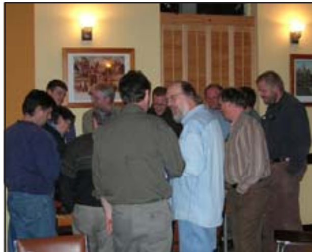
The guys swarming