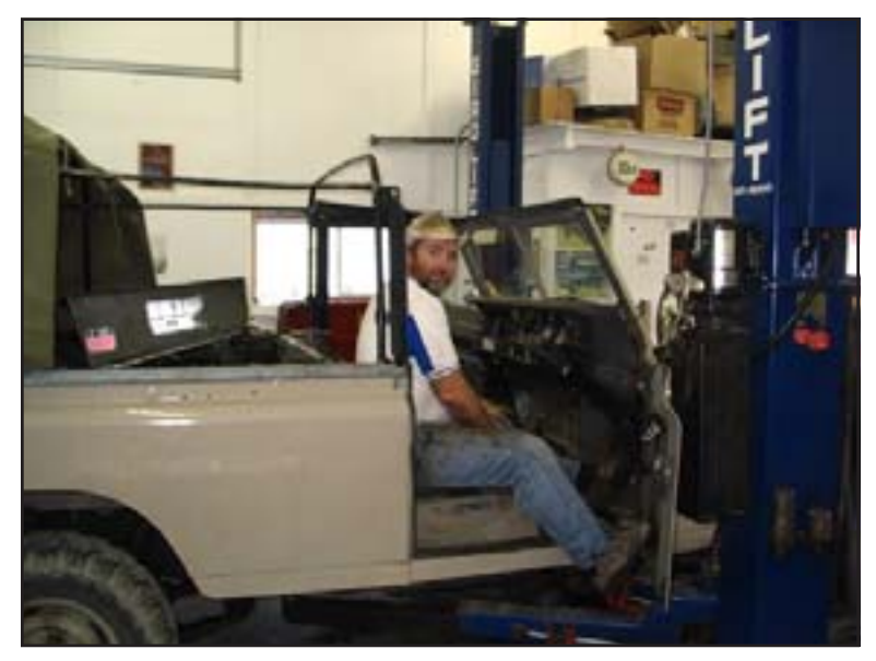
Sitting on the gas tank bleeding the clutch.

So the club comes to my rescue, a member offers the use of his garage if I want to do the work ... Let me think about this, a warm clean, well lighted garage, with the proper tools or my gravel laneway. Arrangements are made to pull the trannie out of Fergie one weekend. See what needs to be replaced and go from there.