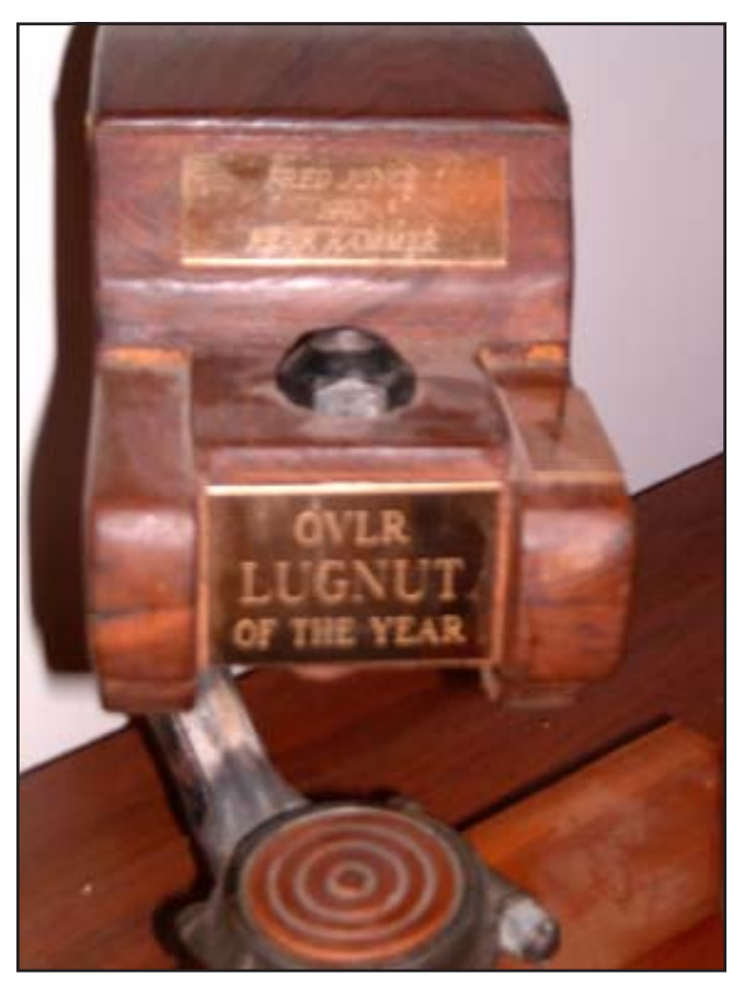
Lugnut of the Year