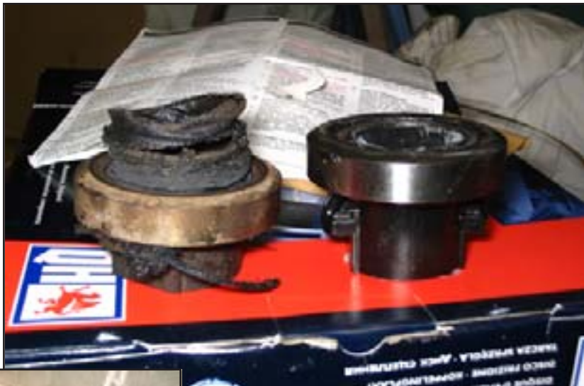
Old vs new.

The answer comes thru in stereo "You got to pull the transmission out to get at the bearing" ... expletive deleted!