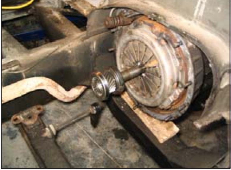
Fitting the new pressure plate on the clutch.