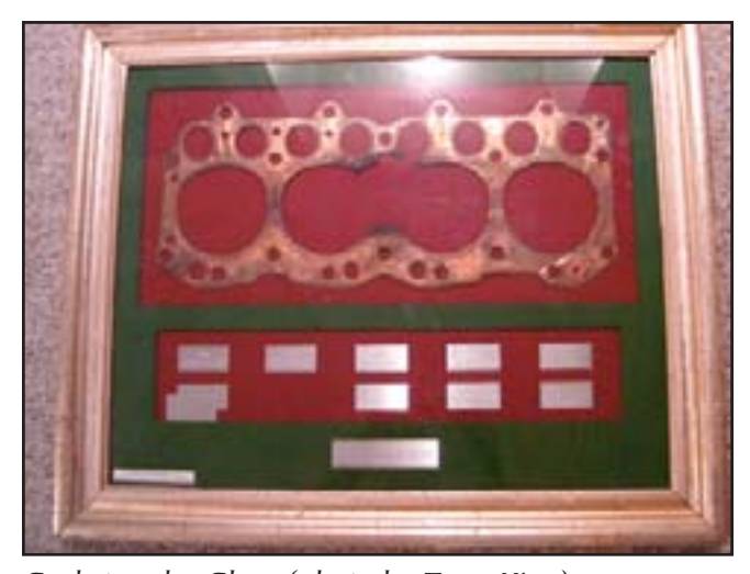
Gasket under Glass