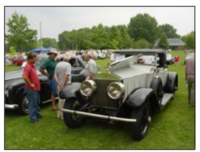
This is the first people's choice winner.

Jaguar and a TR3. I didn't hear the announcement but I'd bet dollar to doughnuts that the Jag was an E-Type.