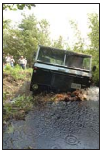
Simon Schofield tackles the creek crossing complete with beaver dam on the Heavy off road at the hydro line.