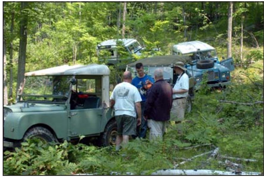
The Prez provides a chain saw during the Medium off road Saturday morning.