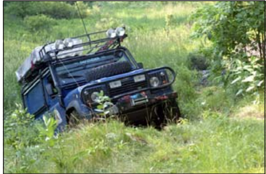
Blue 110 on the Heavy off road Saturday afternoon.