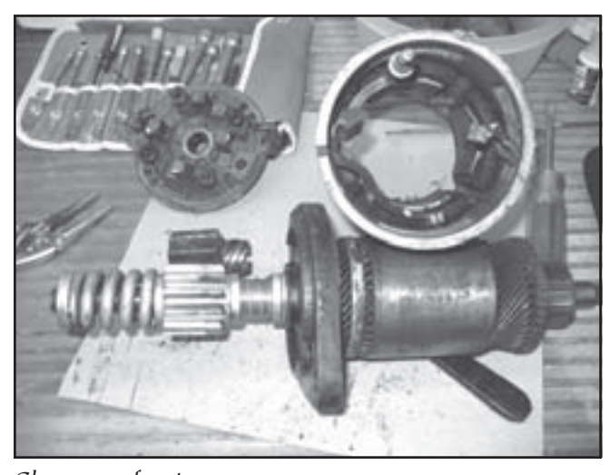
Close-up of guts.

Field coils: These have to be tested in place. They are very difficult to remove -a foolhardy task. There are two brushes and a terminal post connected to them. Touch one probe of your Ohmmeter to the yoke and the other