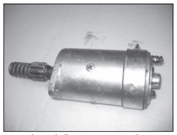
Starter, after much elbow-grease to remove the grease.