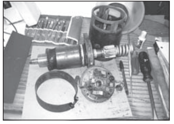
Some tools used to disassemble the starter.

Finally, I had the starter out after wiggling it by and through the muffler and manifold.