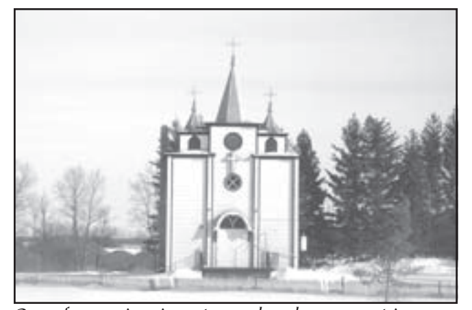
One of many immigrant-era churches on rout in Saskatchewan.