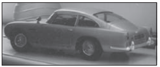
You may or may not agree with Matthew Beard's assertion that Bond's DB5 is the coolest car in the world but I think you might support our opinion that Land Rover is certainly a very close second.

The Land Rover Defender was voted second coolest. First built in 1950, it has outlasted the VW Beetle to become the world's oldest production car.