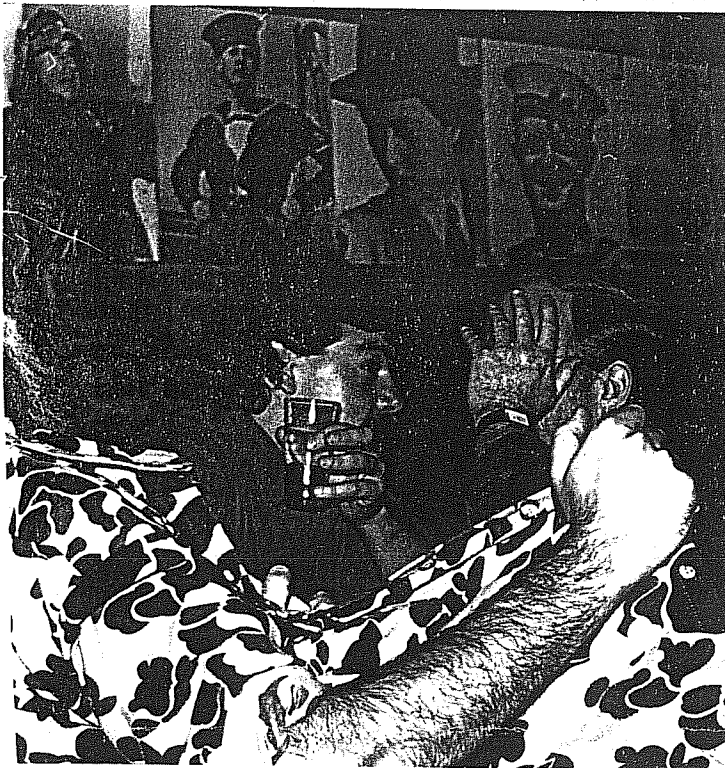
Defending against Bates preaching.