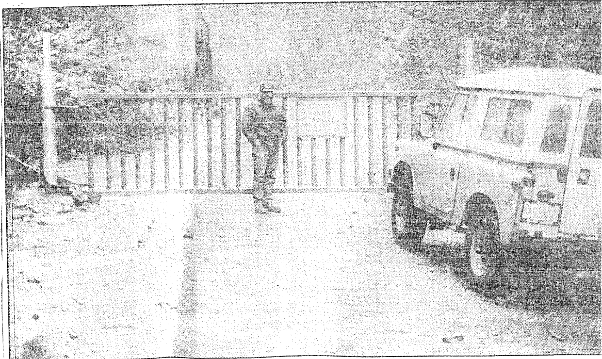
SOOKE off-road enthusiast Ron Low stands beside iron gate that seals off Harbourview Road. Gate was erected by Greater Victoria Water District.(Story page one)

Ron Low is Vice President of the Island Rovers on Vancouver Island, BC