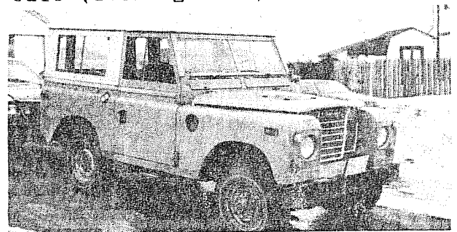
1973 LANDROVER — green, 2 dr., running good, needs some work, as is $700 or reasonable offer, 836-2920 eves. or 724-0401 days